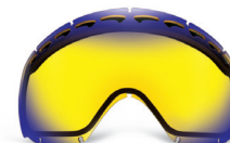
HIGH INTENSITY YELLOW