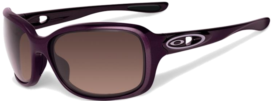
OO9158-06 URGENCY – RASPBERRY SPRITZER W/ G40 BLACK GRADIENT