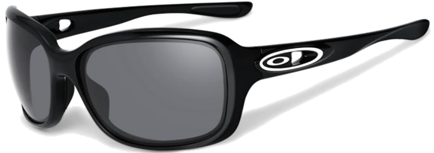
OO9158-03 URGENCY – POLISHED BLACK W/ GREY

+ Available in Oakley Authentic Prescription Lenses